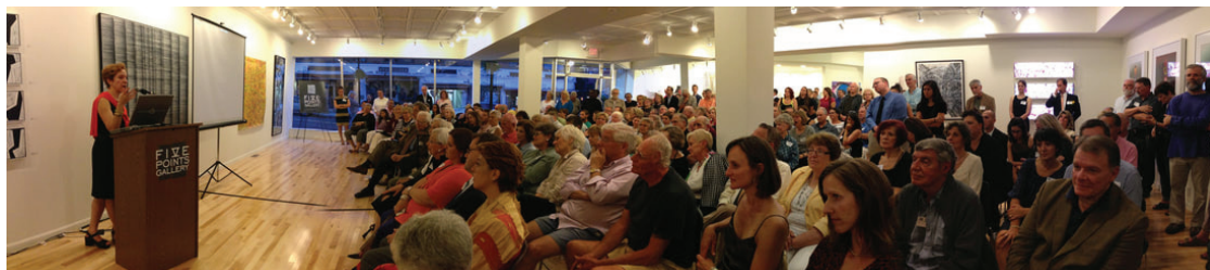
Five Points Gallery