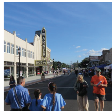
The Warner Theater