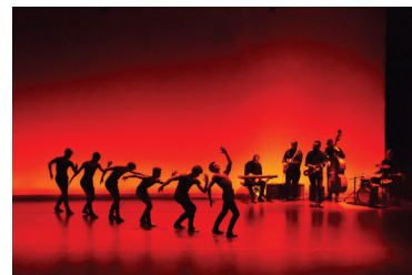
The Nutmeg Ballet Conservatory

These two institutions anchor an entire block of our downtown. A few steps away, Five Points Gallery enjoys a growing reputation as one of Connecticut's outstanding contemporary art venues, having attracted visitors and artists from all over the country. Across the street, the Kids Play Children's Museum fosters imagination and creativity through interactive exhibits and the simple joy of spontaneous play.