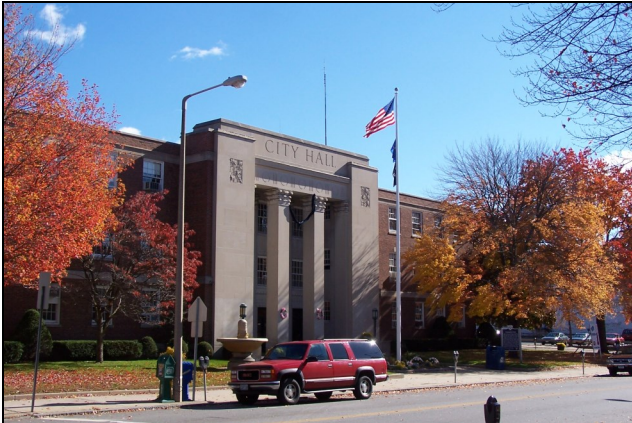
Torrington City Hall