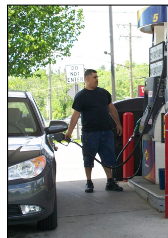
Gas stations are an example of a business requiring Location Approval.

If your proposal involves the repair, sale, or lease of motor vehicles and/ or trailers, you will need to obtain location approval from the Zoning Board of Appeals before you apply for Site Plan, Special Exception or Subdivision approvals. New gas stations and junkyards require location approval from the Planning and Zoning Commission. You should contact the Zoning Enforcement Officer for information and to set up a meeting to discuss all the details.