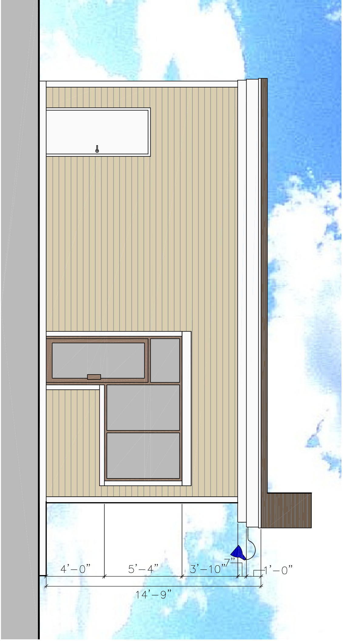
WEST ELEVATION SCALE: 1/8" = 1'-0"