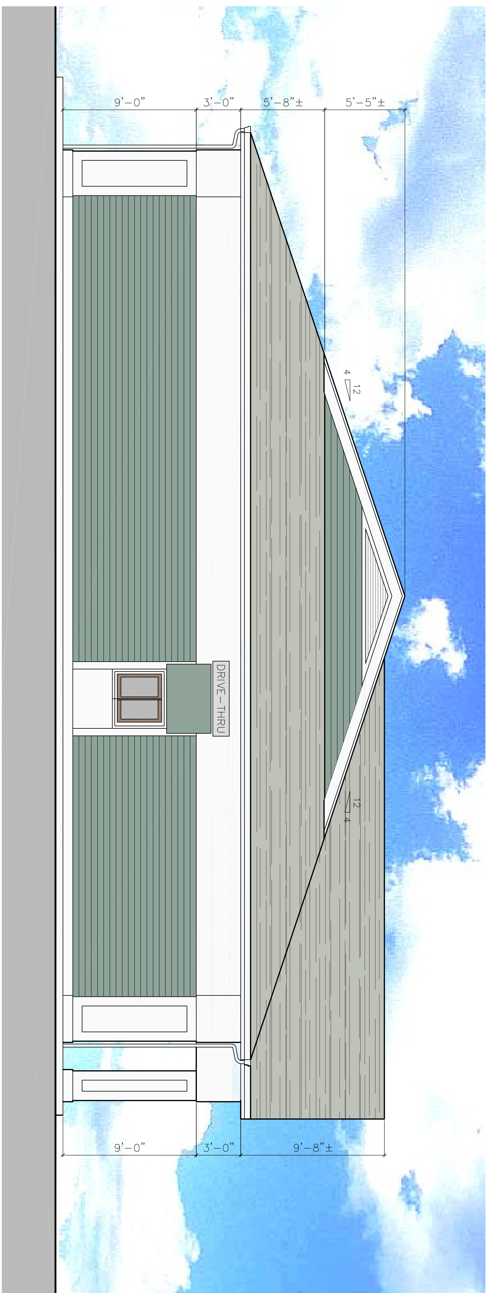
EAST ELEVATION SCALE: 1/4" = 1'-0"

© BORGHESI BUILDING & ENGINEERING CO., INC. ALL RIGHTS RESERVED. NO PART OF THIS WORK MAY BE REPRODUCED, COPIED, OR TRANSMITTED IN ANY FORM OR BY ANY MEANS, WITHOUT THE PRIOR WRITTEN CONSENT OF BORGHESI BUILDING & ENGINEERING CO., INC. P:\Drawing\MSA\Torrington Farms Service Center\Torrington Farms Service Center-187-1000-12.dwg 4/30/2021 9:16:13 AM